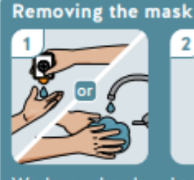
Wash your hands with soap and water or use an alcohol-based hand sanitizer.