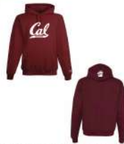
GRAD "CAL" HOODIE