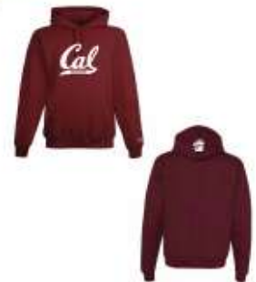
GRAD "CAL" HOODIE