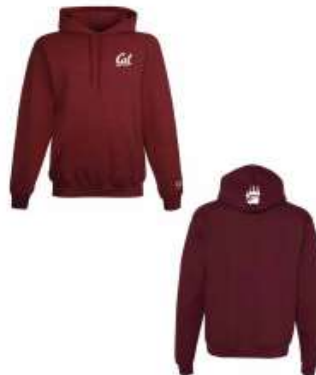
GRAD "CAL" CORNER HOODIE