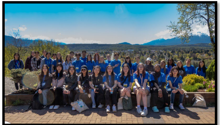
Adventure in Healthcare took place across Terrace between May 1-3.

Earlier this month students from Terrace and Kitimat schools participated in Adventures in Healthcare , a short exploratory program offered in partnership with the Rotary Club, Northern Health, LNG Canada, University of Northern British Columbia, and Coast Mountain College. The goal of the program is to expose youth to a variety of pathways and opportunities leading towards a career in the Healthcare sector. Through hands-on activities and guest presentations, students explored careers related to Nursing, Psychology, Social Work, Density and more. Experiences took place at a variety of Terrace locations including Coast Mountain College, Northern Health, Terrace View Lodge, Cedar Coast Dentist Office and UNBC.