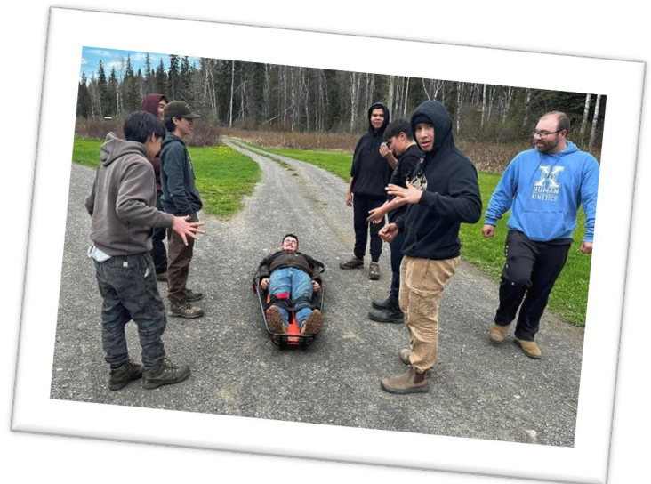
Students and staff from Hazelton Secondary School participate in a land-based learning experience in Upper Kispiox.