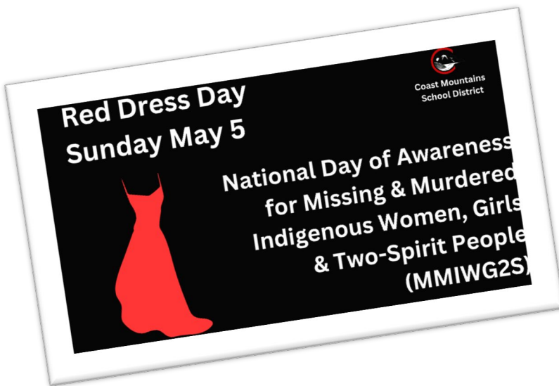
Sunday May 5 was Red Dress Day, and MMIWG2S was a focus of conversation in schools on Friday May 3.