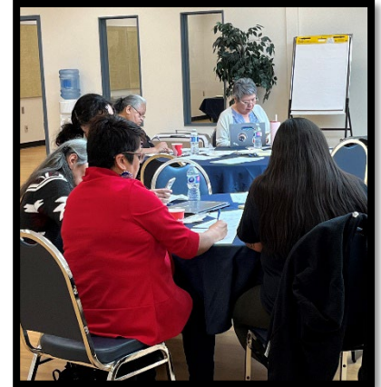
Elders, knowledge holders and district staff collaborate at recent gathering.

The IED intends to increase access to Indigenous Role Models in schools with opportunities to invite Elders and Knowledge Keepers into the classroom to share their expertise and cultural knowledge. Both table talks and circle sharing exercises provided valuable information related to the Indigenous communities, programs, services and individual skills and abilities available for schools and classrooms to access. A 'blue skies thinking' activity resulted in many creative ideas impacting agency for Indigenous learner identity, learner language and culture skills, access to cultural knowledge of their land, and even land-based resources in their schools. The day was such a success that planning for the next gathering is already in the works!