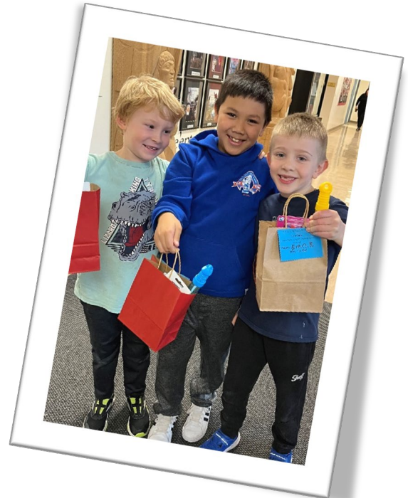
Ts'winaa / Way to Go! award winners at Majagaleehi Gali Aks Elementary School.