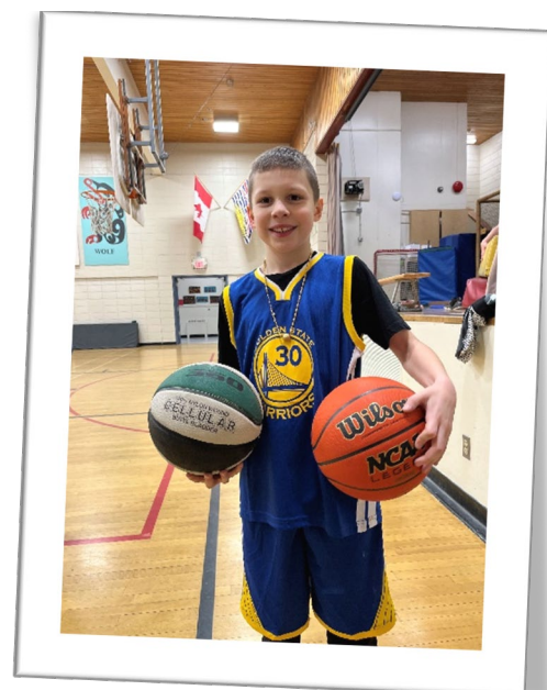
Learners at Suwilaawks Community School have fun on the basketball court during lunch hour.