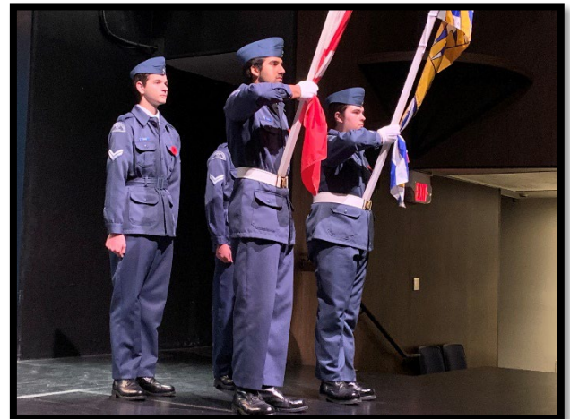
Remembrance Day Service at Caledonia Secondary School in Terrace.