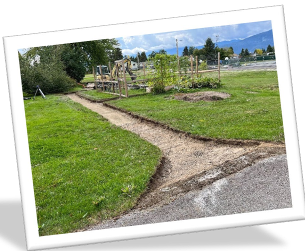
Progress is being made on the Nechako Elementary School Outdoor Learning and Cultural Space.

Coast Mountains School District supports members of the 2SLGBTQIA+ community; you are valued and our schools are better spaces because of you.