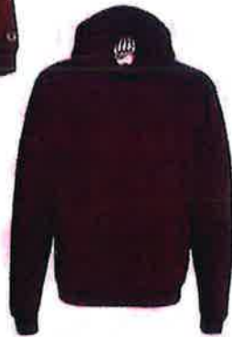
GRAD "CAL" CORNER HOODIE