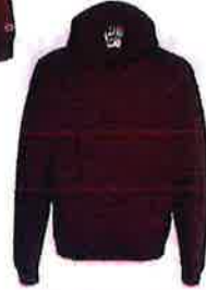
GRAD "CAL" HOODIE