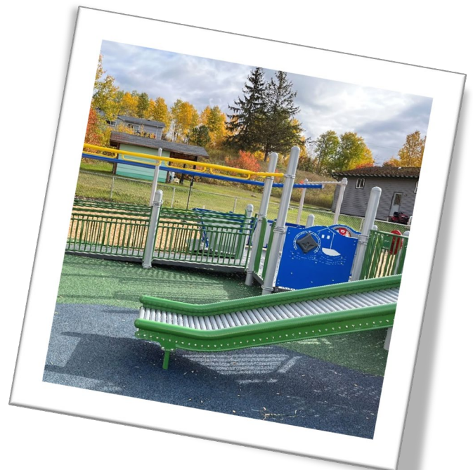
The Majagaleeh! Gali Aks Elementary School community recently opened their new accessible playground structure.

Coast Mountains School District acknowledges with respect the lands on which we live, work, play and learn as the traditional & unceded territories of the Gitksan, Haisla, Nisga'a & Ts'msyen Peoples.