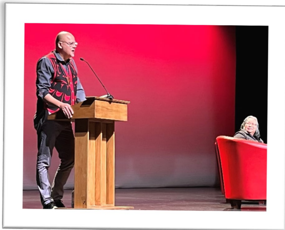
On September 22 CMSD hosted a conference style day of learning for all employees focused on ReconciliACTION.